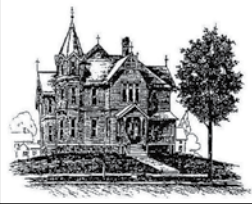
Oshkosh history by the Winnebago County Historical & Archaeological Society