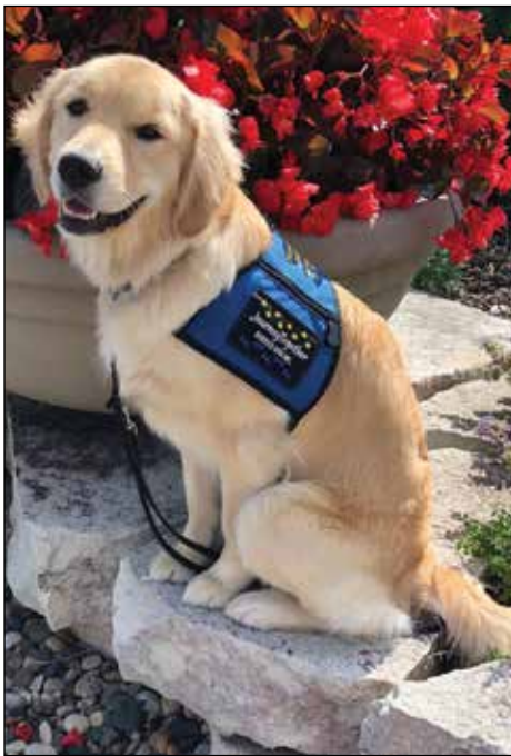
JOURNEY TOGETHER SERVICE DOG

Many of the Journey Together service dogs are donated by breeders. It takes anywhere from eight months to two years for a service dog to be fully trained and ready for placement, such as Tawny shown here. Only one in three dogs will make it through the training and graduate.